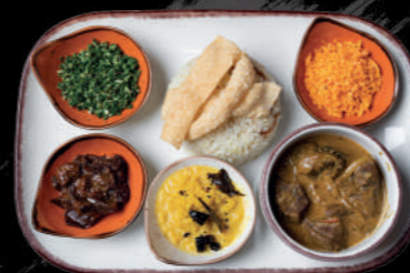
Rice & Curry

AVAILABLE EVERYDAY FROM 12PM TILL 5PM AND 9PM TILL LATE